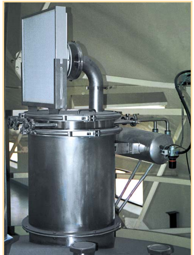
Dust Collector: Colby specialises in sanitary design and fabrication.